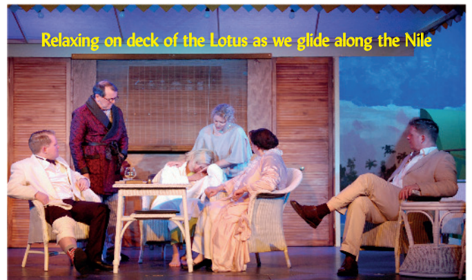
Relaxing on deck of the Lotus as we glide along the Nile