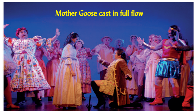
Mother Goose cast in full flow