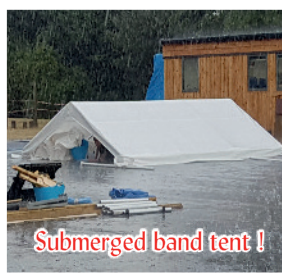
Submerged band tent!

A small selection of photos from the Barnstormers previews at Oxted that tell a story of the change in the recent weather. More in the next issue but 7 days before the performances in Cornwall, all the seats for the evening performances were already sold out, with few left for the matinees.