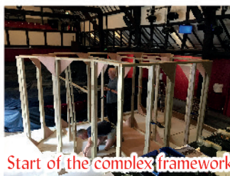
Start of the complex framework