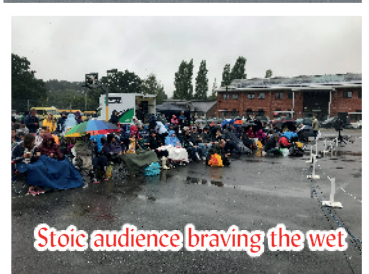
Stoic audience braving the wet

A small selection of photos from the Barnstormers previews at Oxted that tell a story of the change in the recent weather. More in the next issue but 7 days before the performances in Cornwall, all the seats for the evening performances were already sold out, with few left for the matinees.