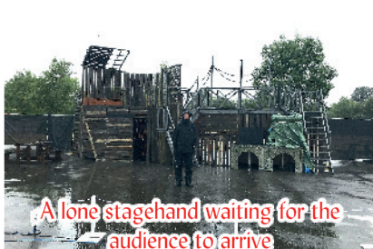
A lone stagehand waiting for the audience to arrive