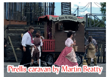
Pirellis caravan