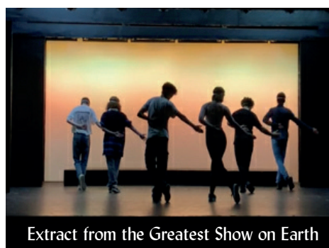
Extract from the Greatest Show on Earth

"I regard the theatre as the greatest of all art forms, the most immediate way in which a human being can share with another the sense of what it is to be a human being." - Oscar Wilde