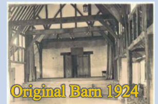
Original Barn 1924

OUR OPENING PRODUCTION IN MAY 1924 100 YEARS AGO