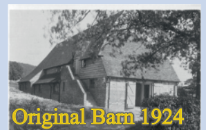
Original Barn 1924