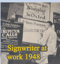
Signwriter at work 1948