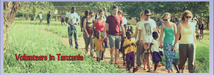
Volunteers in Tanzania

Tickets are available by telephone 01959561811 or for credit and debit card orders www.barntheatreoxted.co.uk