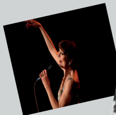
Anita Harris in concert