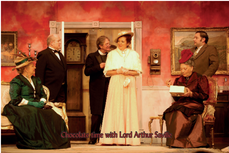
Chocolate time with Lord Arthur Savile