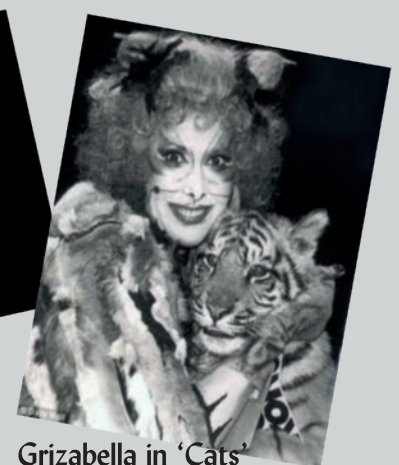
Grizabella in ‘Cats’