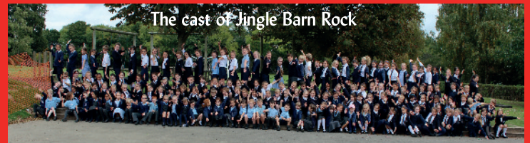
The cast of Jingle Barn Rock

The excitement is palpable at St Mary's and Downs Way schools as we gear up for our Christmas extravaganza - Jingle Barn Rock! Over the past