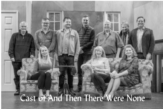
Cast of And Then There Were None

We managed to complete our recent run of Agatha Christie's And Then There Were None without any hiccups or positive tests! It was performed to over 800 people across 6 performances which is a fantastic attendance for a play...and I am told the first time in 40 years TOPs has performed a play on a Tuesday. A huge thank you to everyone who came along to watch, to everyone who helped front of house and all those involved behind the scenes. Finally, congratulations to the cast for what were consistently brilliant performances across the board. We couldn't have wished for a more successful relaunch of our main programme in the theatre.